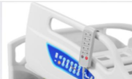
Has remote control aside from the buttons at the side of the bed